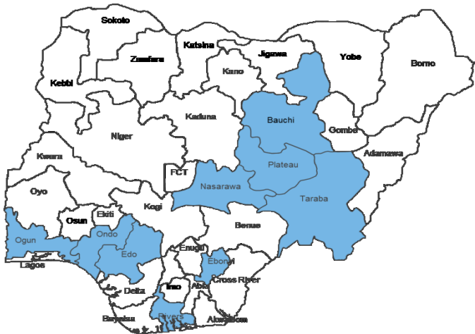
Figure 1. States with confirmed cases as at Feb. 3, 2017