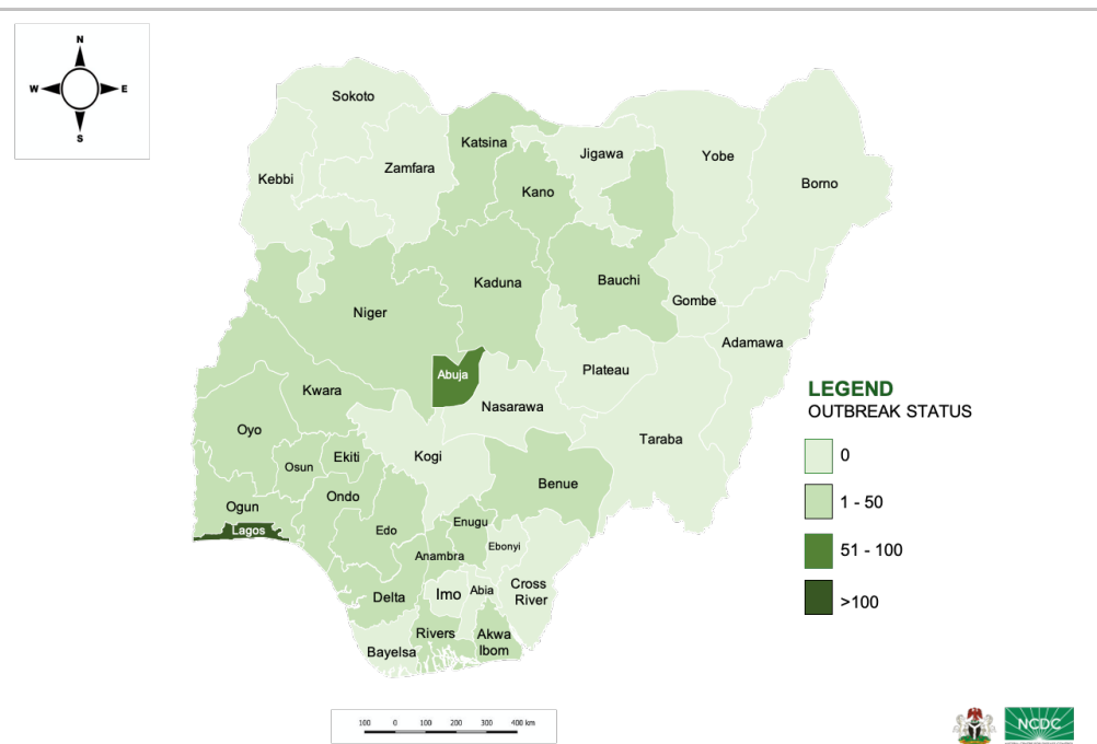
Fig. 1: Map of Nigeria showing the affected 19 States and FCT by COVID-19