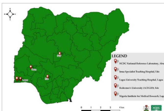
Fig. 2: Map of Nigeria showing COVID-19 testing laboratories